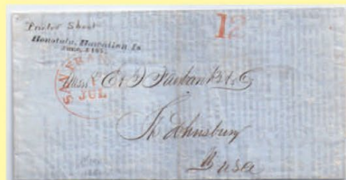
Honolulu Straight Line Cancel