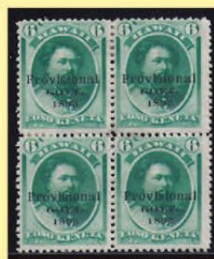
Rare 66C Block

FROM RARITIES TO COMMON GEMS TO NOT (MANY NOT ON THE MARKET FOR HALF A CENTURY!)