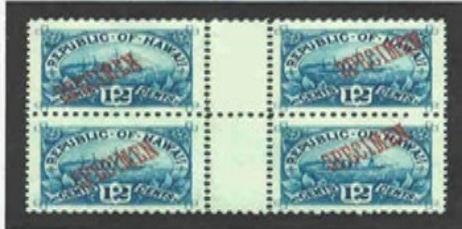
Hawaii #78, Gutter Specimen Block 12 Cent Blue, 1894, World Class Rarity

STAMPS, COVERS, PROOFS, ESSAYS BUYING & SELLING