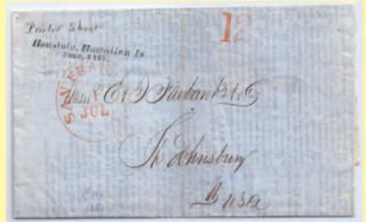
Honolulu Straight Line Cancel