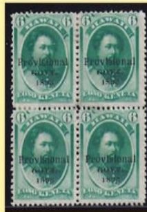
Rare 66C Block

FROM RARITIES TO COMMON GEMS TO NOT (MANY NOT ON THE MARKET FOR HALF A CENTURY!)